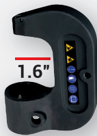
Small Clamp DF-SPRHR1S