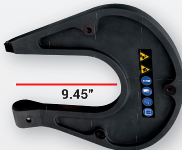
Large Clamp DF-SPRHR3