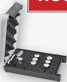
FORD Die Set DF-SPR/FORD