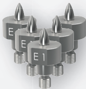
Extractor Die - 5 Pack DF-SPR/E1X5